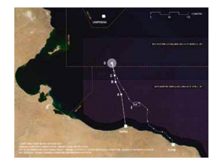
(A) migrants' boat first spotted by a French aircraft; (B) & (C) distress calls & military helicopter visits; (D) boat runs out of fuel & starts to drift; (E) encounter with a military ship. The boat briefly entered the Maltese Search & Rescue zone (----) but always remained with NATO's maritime surveillance area (//// ).

In 2011, in the context of the military intervention in Libya, more than 40 military ships and aircrafts were deployed in the Central Mediterranean. These waters were arguably the most surveilled waters on earth at the time. Despite this presence, over 2000 people died at sea. One particular event provoked widespread public outrage. On the 27 of March 2011, 72 Sub-Saharan migrants left Tripoli on-board a small rubber dinghy in the attempt to reach the Italian island of Lampedusa. After having covered approximately half of the distance, they ran out of fuel and started drifting in the open sea. Despite reporting their position via satellite phone to the Italian Coast Guard (which later informed their Maltese colleagues and NATO) and despite having been approached by at least a patrol aircraft, a military helicopter, two fishermen's boats and a large military vessel, nobody intervened to rescue them. After 14 days of drift during which, with no water or food on board, 63 people died, 9 survivors landed back on the Libyan coast.